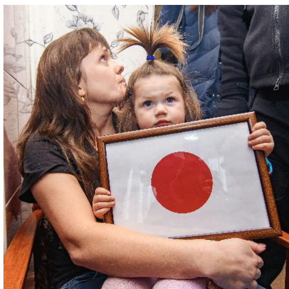
A little girl holds the Japanese flag during a visit by Ambassador Shigeki Sumi to eastern Ukraine.