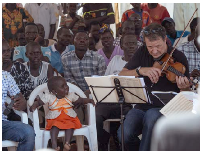
A young girl enjoys the music by Lucerne Festival Orchestra in a refugee settlement.

■ Tightly earmarked ■ Earmarked ■ Softly earmarked (indicative allocation) ■ Unearmarked (indicative allocation) Funding gap (indicative)