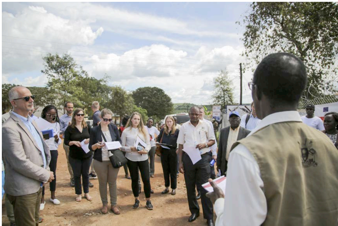
Ugandan doctor briefs visiting Ambassadors and diplomats about health care services for refugees and host communities at Bujubuli Health Centre III in Kyaka II refugee settlement, Kyegegwa district.