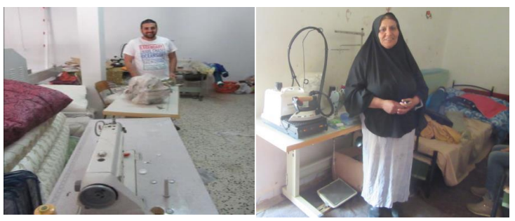
Women and man refugees receiving toolkits for sewing/hair dressing/electricity in May 2016

Since February 2015, UNHCR and its partner ADRA are implementing an innovative programme to support refugees' self-reliance and ability to access livelihood opportunities through tailored training aimed at improving the technical skills and employability. During the first half of 2016, some 28 refugees benefitted of various vocational trainings (such as sewing, beekeeping, baking pastry, etc.) and 26 refugees were directly employed in different companies. Furthermore, seven income-generating microprojects were launched, benefiting to a total of 68 refugees.