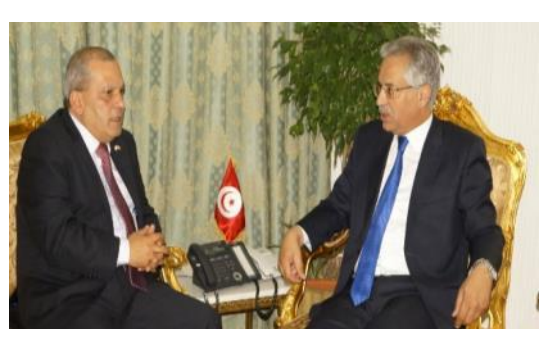
UNHCR Representative meets with the Tunisian Minister of Justice to coordinate and discuss on issues of mutual interest, including the national asylum law.

In the absence of a national asylum law in Tunisia, UNHCR conducts refugee status determination in Tunisia. UNHCR ensures that asylum-seekers and refugees are registered, issued with UNHCR certificates and protected against refoulement. UNHCR supports Tunisia into creating a comprehensive national protection system. Since 2011, UNHCR supports the drafting of a national asylum law and carries out advocacy and capacity building initiatives to help Tunisian authorities finalize the text. In June, the finalized draft law developed by the Ministry of Justice was shared with the Prime Minister for ministerial review in view of its adoption by the Parliament.