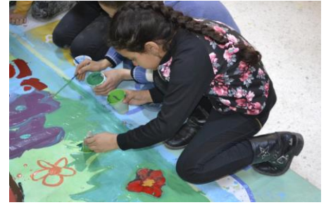
Coloring activity for refugee children during Festival des nez rouges.