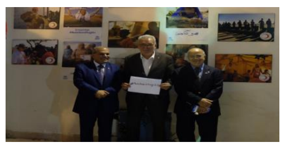
UNHCR Representative, Minister in charge of Relations with the Constitutional Institutions and United Nations Resident Coordinator holding a sign #Iam with refugees .

the Minister in charge of relations with the constitutional institutions; it gathered civil society and human rights representatives as well as government and diplomatic officials and regionally well-known artists. The event was widely covered by national and international media, with an emphasis on the necessity to adopt a national asylum law in Tunisia.