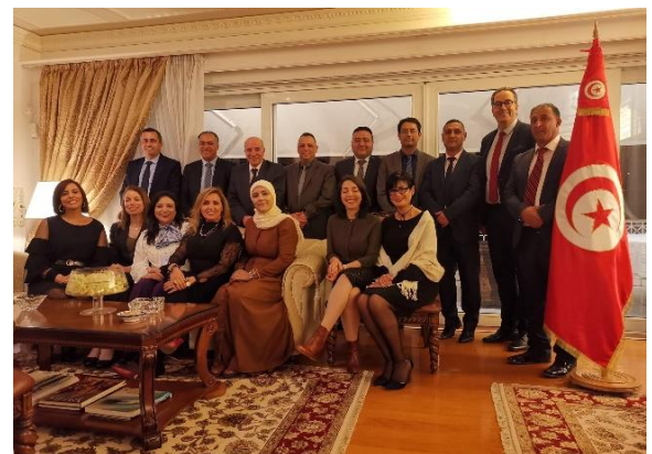
The participants in the study visit to Greece were received by the Tunisian Ambassador to Greece

A study visit was organized to Greece from 12 to 15 February with a group of Government officials from various Ministries (Interior, Defence, Foreign Affairs, Social Affairs), Parliament, and the Presidency. This is the fifth study visit jointly led by UNHCR and its partner the Arab Institute for Human Rights (AIHR) to increase the Government's exposure and knowledge of asylum and refugee issues based on other countries' experience. With support from the European Union-funded Regional Development and Protection Programme, the visit highlighted similar challenges between Greece and Tunisia in the management of mixed population flows, particularly in the identification and referral of persons of concern.