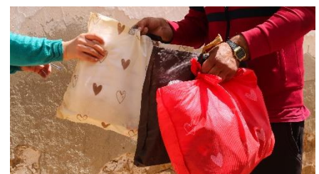
UNHCR partner CTR distributing hygiene kits in southern Tunisia

Starting from 18 April, 1,327 hygiene kits, including gloves and masks, were distributed to refugees and asylum seekers living in shelters and urban areas of Sfax, Medenine, Zarzis, Ben Guerdane, Tataouine. During the distribution, awareness sessions on preventive hygiene measures to adopt were conducted. Psychologist from partner CTR was also present to provide counselling.