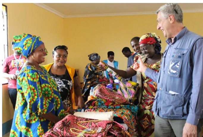
UN High Commissioner for Refugees Mr. Filippo Grandi speaking to refugee women in Nyarugusu camp during his mission to Tanzania