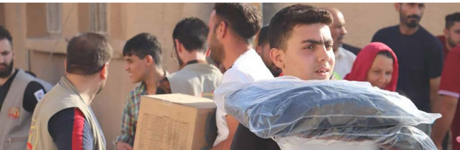
Recently displaced people in North-east Syria receive UNHCR core relief and winter items, distributed by local partners at the Tal Tamer communal shelter.

*The funding level varies from country to country