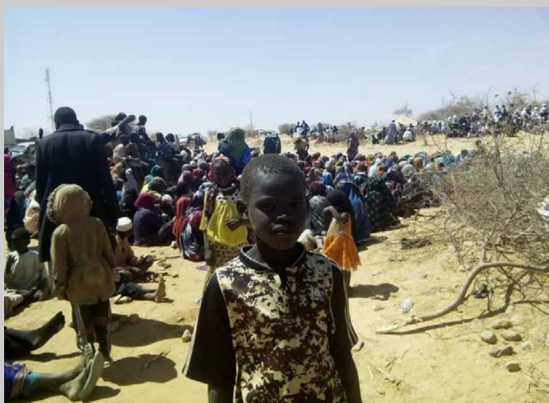
Displaced families in Tina town near the gathering point where they are currently staying out in the open, exposed to the elements.

However, as social norms are starting to change, both, members of minority and majority, are calling for equality.