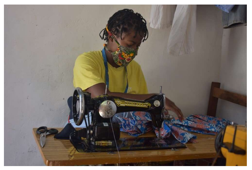
A refugee woman involved in the production of cloth face masks in Maratane Refugee Camp, Mozambique