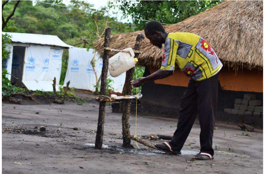
A South Sudanese refugee in Bele settlement, DRC, uses a handwashing station he made from recycled materials as part of the “Tippy Taps” challenge to help prevent COVID-19.

8,873,757 persons of concern in the region, including 768,694 refugees, 311,032 asylum-seekers, 5,600,782 IDPs, and 2,134,349 IDP returnees (as of 3 May).