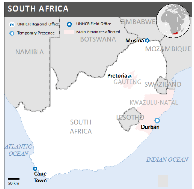
The boundaries and names shown and the designations used on this map do not imply official endorsement or acceptance by the United Nations. *Serbia and Kosovo (S/RES/1244(1999)). Creation date: 01 May 2015.