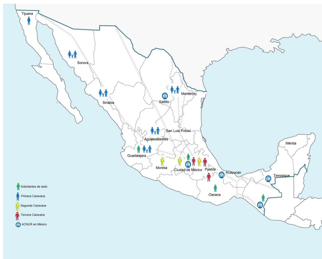
Locations of migrants and asylum-seekers of the “caravans” and UNHCR offices