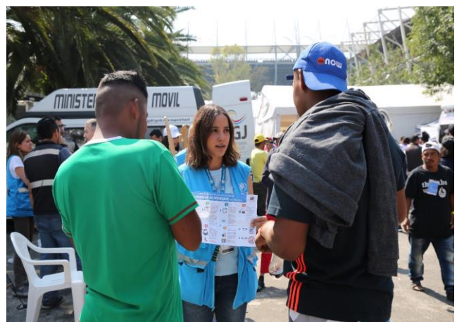
UNHCR staff informs people in need of International Protection about the Mexican asylum system, Mexico City, 08 Nov 2018.

UNHCR and partners doubled its shelter capacity for asylum seekers by 448 spaces and are currently developing a contingency plan to further increase the capacity by around 1,500 spaces in strategic locations across Mexico.