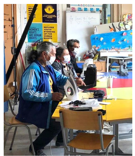
Asylum-seekers and migrants sewing protective masks in Vranje RTC, ©UNHCR, April 2020