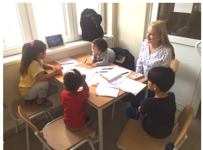
Supporting the education of asylum-seekers' children 1 October 2019

CO in Belgrade, FU in South Serbia, regular monitoring presence in five Asylum Centres and 25 other sites across the country