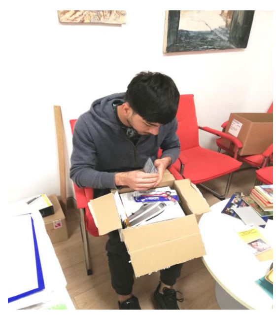
Young asylum-seeker, studying to become a barber in Serbia, ©UNHCR, May 2020

Country Office in Belgrade and Field Unit in South Serbia for regular protection monitoring in five Asylum Centres and 25 other sites across the country