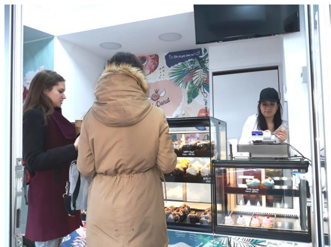
This donut shop in Belgrade was opened and is run by a refugee family ©UNHCR, 1 December 2019

CO in Belgrade, FU in South Serbia, regular monitoring presence in five Asylum Centres and 25 other sites across the country