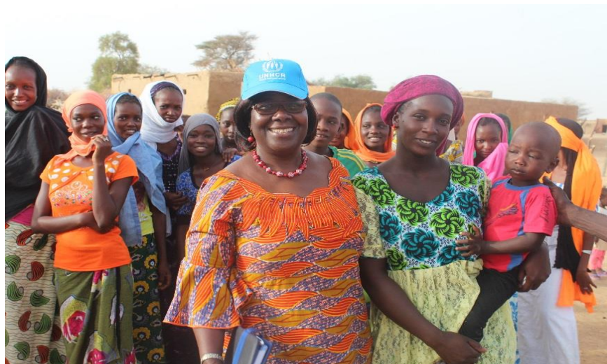
The Regional Representative in Ando, Ndioum, during her visit in the Senegal Valley region from 21-27 June 2017