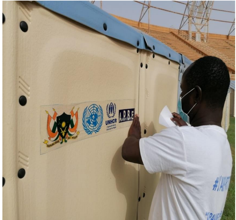
One of over 400 Refugee Housing Units donated by UNHCR to serve as emergency medical facilities and isolation units in Niger.