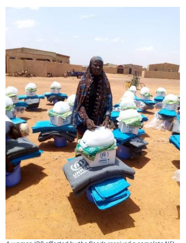
kit to make it easier for her and her family to settle in the new site in Kongoussi, Burkina Faso.

The combined impact of insecurity and the spread of COVID-19 in the Sahel is particularly devastating on the education sector with school closures no longer restricted to conflict areas but generalized to the entire countries. The negative outcomes of prolonged school closures are likely to disproportionately impact displaced children, who not only see their education interrupted but also lose the safety offered by a school and get exposed to a higher risk of abuse, neglect, violence and exploitation. The situation is especially precarious for girls who are more at risk of permanently A woman IDP affected by the floods received a complete NFI dropping out, exposing them to forced marriage. Ensuring continuity of education for displaced children and youth is challenging, especially in rural areas