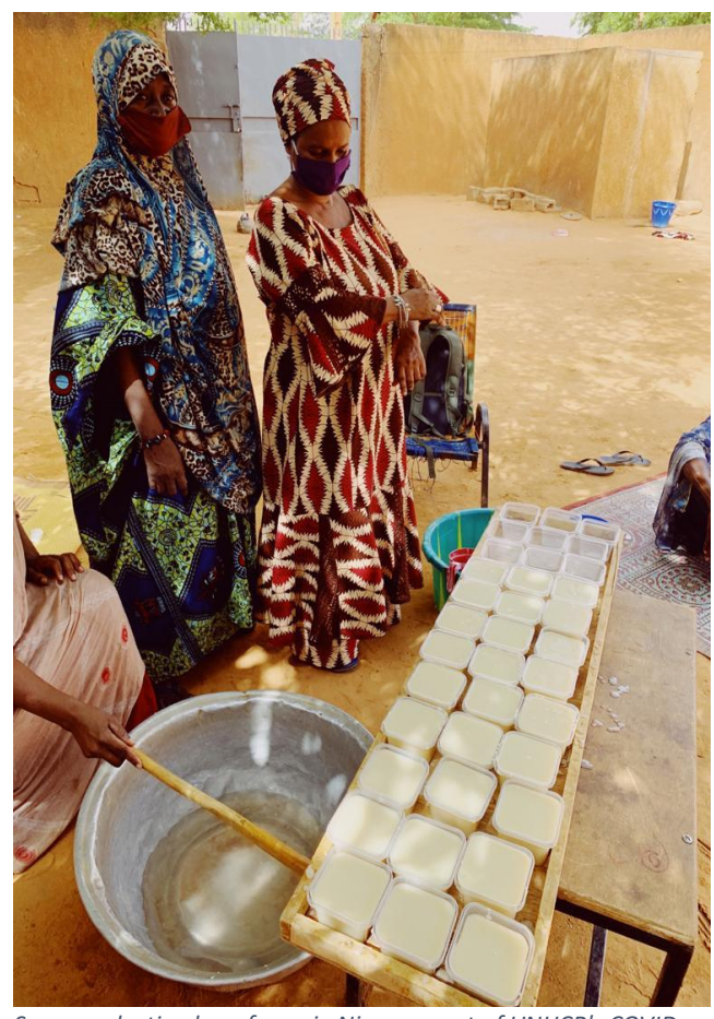
Soap production by refugee in Niger as part of UNHCR's COVID response.

In many parts of the Sahel, refugees and IDPs are often residing in overcrowded camps and sites, or among host communities under precarious conditions across historically underserved areas. Due to poverty, many people resort to building precarious shelters with tree branches or cardboards and are thus deprived of privacy and exposed to theft and violence. In these dire living conditions, with limited access to water and hygiene facilities, forcibly displaced persons are often unable to apply the most basic preventive measures such as social distancing and handwashing, exposing themselves to heightened risks of contamination as COVID-19 spreads towards major hosting areas. To address this issue. UNHCR operations are implementing targeted shelter interventions and the distributions of core relief items and exploring ways to decongest the most affected hosting areas in coordination with the national and local authorities.