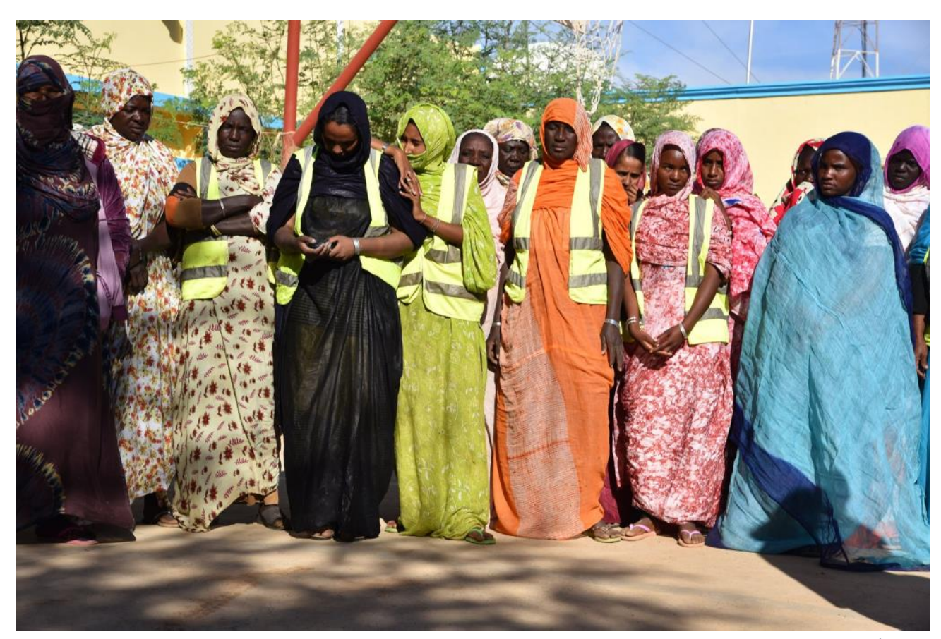
Malian refugee women part of the VRPC group during the IVD celebrations in Bassikounou (South-east Mauritania)