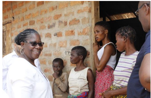
UNHCR Regional Representative with refugees in their permanent shelter in Adagom settlement, Cross River state.

Cameroonian refugees registered in Adagom settlement, Cross River State [as of 30 th November 2018]