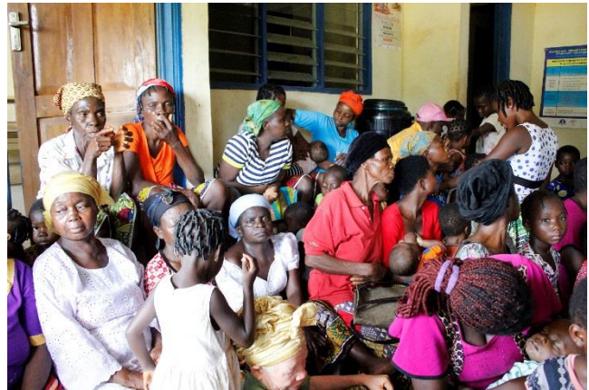
Cameroonian refugees waiting for medical consultation at the Primary Healthcare Centre in Amana, Cross River State

Cameroonian refugees registered in Adagom settlement, Cross River State [as of 15 th October 2018]