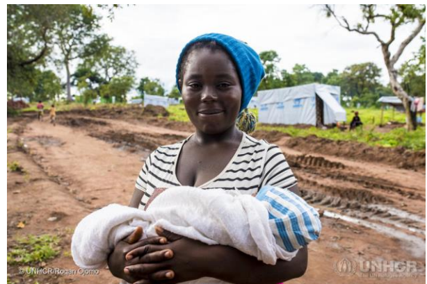
Cameroonian refugees with his new born baby in Adagom settlement.

Cameroonian refugees registered in Adagom settlement, Cross River State [as of 15 th November 2018]