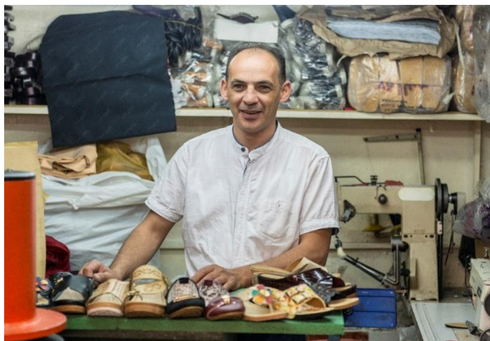
A shoemaking workshop run by a Syrian refugee in Casablanca.