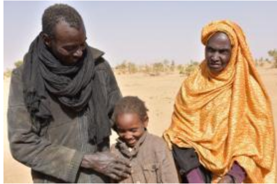
Boughlingala residents wear newly distributed jackets to protect them from the cold season.