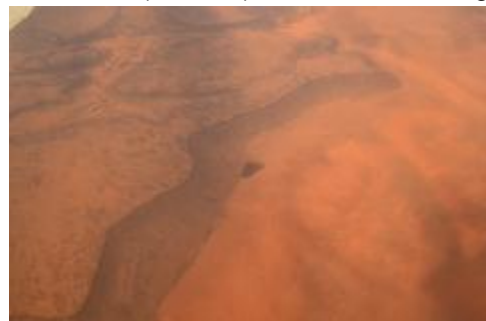
The region hosting Mbera refugee camp is particularly remote and hard to reach by roads.

Due to funding gaps, the United Nations Humanitarian Air Service (UNHAS) is at risk of being suspended in 2018. UNHCR recognizes the crucial importance of this service in maintaining protection and assistance in Mbera camp and to allow humanitarian actors to operate in the remotest areas of the country.