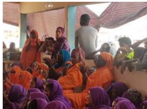
Sensitizing session about women's rights at a community center in Mbera camp.