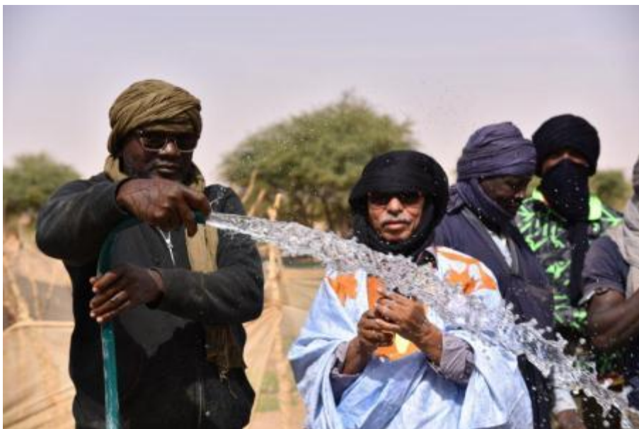
UNHCR and its partner SoS Desert improved access to water for the host communities in Boulinghala village, located some 15 km from Bassikounou, in the area surrounding Mbera refugee camp. Thanks to an improved well, the communities have started gardening.

Since 2012, UNHCR has led the humanitarian response for Malian refugees in the Hodh ech Charghi region, in collaboration with the Mauritanian Government, which continues to keep its borders open to new influxes, and in cooperation with other UN agencies, national and international NGOs. Despite the conclusion of a peace agreement in Mali in June 2015, large-scale returns of refugees are not yet expected due to the security situation in northern Mali. In June 2016, Mauritania, Mali and UNHCR concluded a Tripartite Agreement for the voluntary repatriation of Malian refugees. This agreement will provide a framework to facilitate voluntary return, when the conditions in Mali will allow. In the meantime, it reaffirms the commitment of Mauritania and Mali to protect refugees.