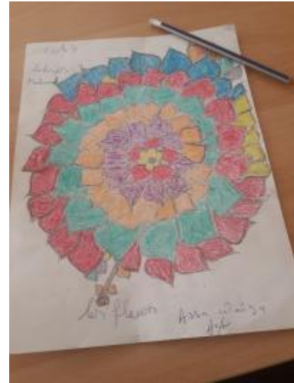
The winner of a drawing context held in one of the six primary schools in Mbera refugee camp.