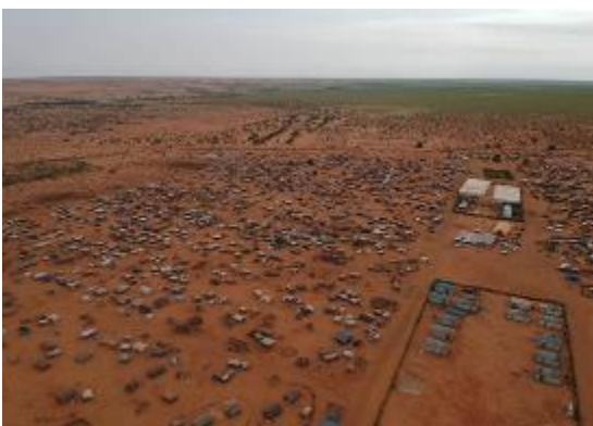
Aerial view from Mbera camp

A total of 59,525 people are assisted by UNHCR in Mauritania.