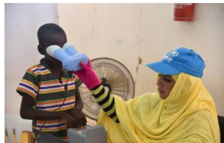
UNHCR continues to register Malian refugees through the BIMS system

In order to strength and build adequate referral pathways, advocate for inclusion of refugees in all national protection mechanisms UNHCR is meeting with partners in order to bring refugee issues in key child protection ongoing discussions.