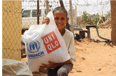
UNIQLO clothes distribution in Mbera camp

In urban areas, in collaboration with the Mauritanian Ministry of Health National Program for the Fight against Malaria (PNLP) , during the month of August UNHCR distributed mosquito nets to 728 refugees and asylum-seekers .