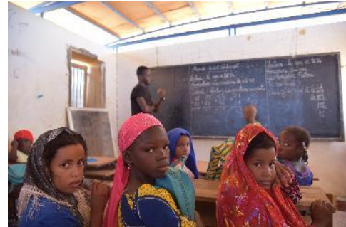
Children attending the remedial classes in one of the six schools in Mbera camp

In August, 4 urban refugee students (2 girls and 2 boys) were successfully admitted to the primary cycle national exam, 1 urban refugee student passed the national secondary school exam, and 2 urban refugees students passed the Baccalaureate exam.