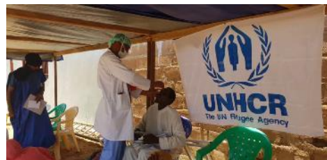
A doctor of the medical caravan taking care of a Malian refugee

UNHCR referred 24 patients from Mbera camp to Kiffa, Nema and Nouakchott hospitals. Fifteen refugees were provided cash support to cover medical needs. UNHCR and its partner, the Lutheran World Federation (LWF) ensure medical evacuations for secondary and tertiary medical cases of refugees and host community patients who cannot be treated in the camp or in Bassikounou. In addition, 308 urban refugees received health assistance including check-ups, medical visits and surgeries.