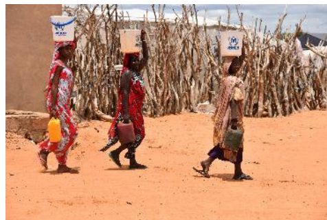
Refugee women bring home water from the water point in Mbera camp

During the reporting period, UNHCR continued with routine monitoring and network management activities to make the water system in Mbera camp more efficient. These maintenance works included the change of 10 taps in all camp areas, the repair of 5 faucets, the change of two valves to reduce water loss, the clogging of 4 leaks, and the maintenance of meters.