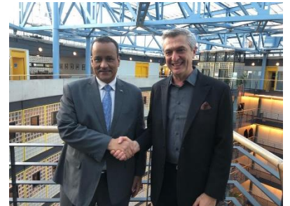
UNHCR High Commissioner Filippo Grandi with the Mauritanian Minister of Foreign Affairs at the Global Refugee Forum

In December, during the opening session of the first Global Refugee Forum in Geneva, Mauritania pledged to: Prepare the draft law on the right of asylum for adoption by 2020; register all refugees with civil registry offices to enable them to obtain a national identification number and the issuance of a secure national identification card and allow their inclusion in national systems, including statistics; ensure the inclusion of refugees in health services on an equal basis with nationals; and ensure that refugees have the same conditions of access to the labour market as nationals. The Minister of Foreign Affairs represented Mauritania at the Global Forum.