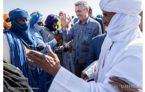
UNHCR High Commissioner meets with Malian refugees in Mbera camp

In Nouakchott, the High Commissioner met with the Prime Minister, as well as the ministers of health, interior and defence. During the meetings, he congratulated Mauritania for its welcoming stance towards refugees, and for its pledges at the Global Refugee Forum to include refugees into its national health system, despite its own challenges. He also met with the UN partners and donors to discuss the cooperation regarding the provision of support to refugees in Mauritania. The High Commissioner also went to Mbera refugee camp, fifty km from the border with Mali, where he was warmly welcomed by the local authorities and refugees. He exchanged with them on their needs, while visiting the registration centre, a vocational training centre run by the ILO in collaboration with UNHCR, and the health centre in Bassikounou.