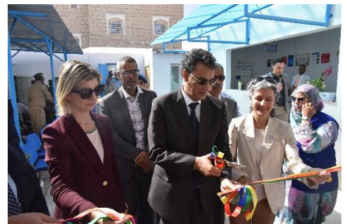
The Waly (Governor) of Nouadhibou, IOM and UNHCR Representatives cut the ribbon of the new joint office

In February, UNHCR and IOM inaugurated a new joint office in Nouadhibou, on the northern shore of Mauritania. The government and several consular delegations and international actors attended the inauguration. Last year, UNHCR had conducted a study on migrants and refugees in the city of Nouadhibou which made it possible to better estimate the refugee population (about 10,000) and offered the basis for designing UNHCR's additional protection interventions. In 2020, UNHCR will begin registering Malian asylum seekers in Nouadhibou.