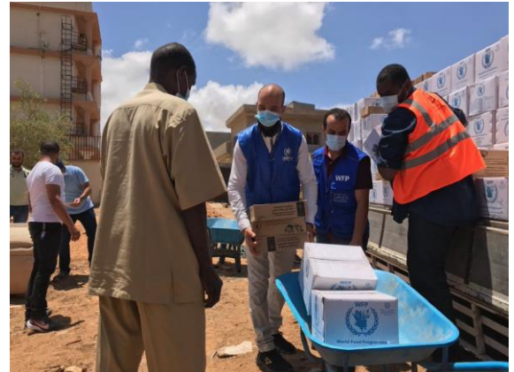
UNHCR and WFP providing food parcels to last for one month at UNHCR's Serraj Registration Office.

Special thanks to major donors: Canada | Denmark | European Union | Finland | France | Germany | Italy | Japan | Norway | Sweden | Switzerland | The Netherlands | United Kingdom | USA | Private Donors