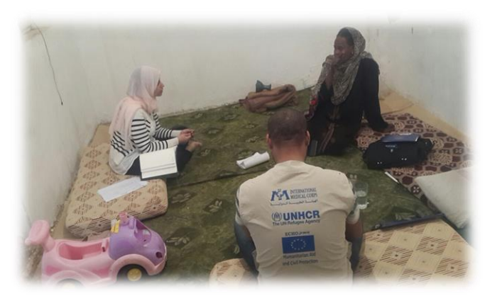
UNHCR partner IMC visits a vulnerable refugee family

Refugees and asylumseekers can reach UNHCR at two Community Development Centres run by partners CESVI and IMC in Tripoli and Outreach Benghazi. visits reached 110 vulnerable families who needed specialised assistance.