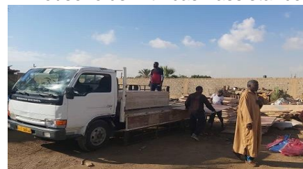
Distribution of UNHCR Shelter kits by NRC to Tawerghan IDPs in Benghazi Shebna camp.

UNHCR continues to provide assistance to internally displaced persons (IDPs) in Libya. To date in 2019, UNHCR has provided core relief items (CRIs) to more than 21,800 IDP individuals and supported over 900 IDP households with cash assistance. So far this year, UNHCR has also implemented 23 quick impact projects across Libya to support both IDPs and host communities. In eastern Libya this week, UNHCR partner, NRC distributed UNHCR shelter kits to 22 Tawerghan IDP families (86 individuals) in the Shebna IDP camp in Benghazi and a redistribution at other Benghazi Tawerghan camps to 76 families (397 individuals) who had not benefitted during an earlier distribution.