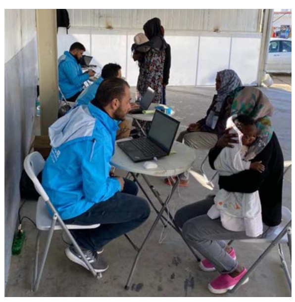
UNHCR conducting registration activities at Tri q Al Sika detention centre in Tripoli.

On 15 January, a total of 19 refugees and asylum-seekers were released from Triq Al Sika detention centre, following UNHCR's advocacy. The group, comprising two men, 13 women and four children, were transferred to the CDC. They were provided with core-relief items (CRIs), cash grants and medical assistance.