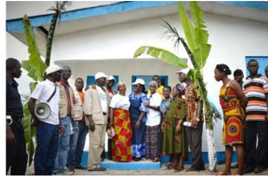
The prototype shelter was inaugurated by RRWA, local and county authorities, refugees and host community.