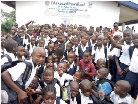
Junior High students.