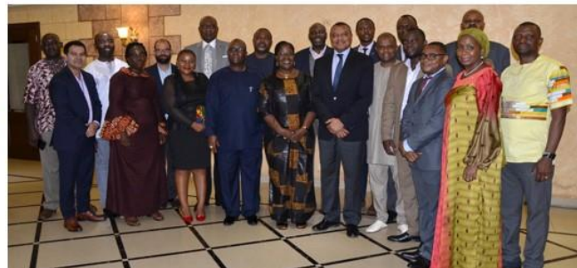
(L) The Second Counsellor of the Ivorian Embassy in Liberia joined the mission and encouraged refugees to make the most of the safe environment in Cote d'Ivoire and return to their home country. (R) RRWA hosts dinner with UN Agencies, RC, CDI Embassy, government officials and Partners.