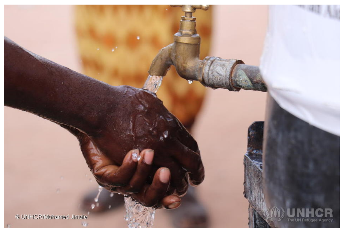
On 1 June, UNHCR, WFP and partners started distribution of food, soap and relief items to refugees in Dadaab camps, while encouraging social distancing and hand washing.

There are nine confirmed COVID-19 cases in the refugee camps, with eight in Dadaab and one in Kakuma who are all stable and asymptomatic.