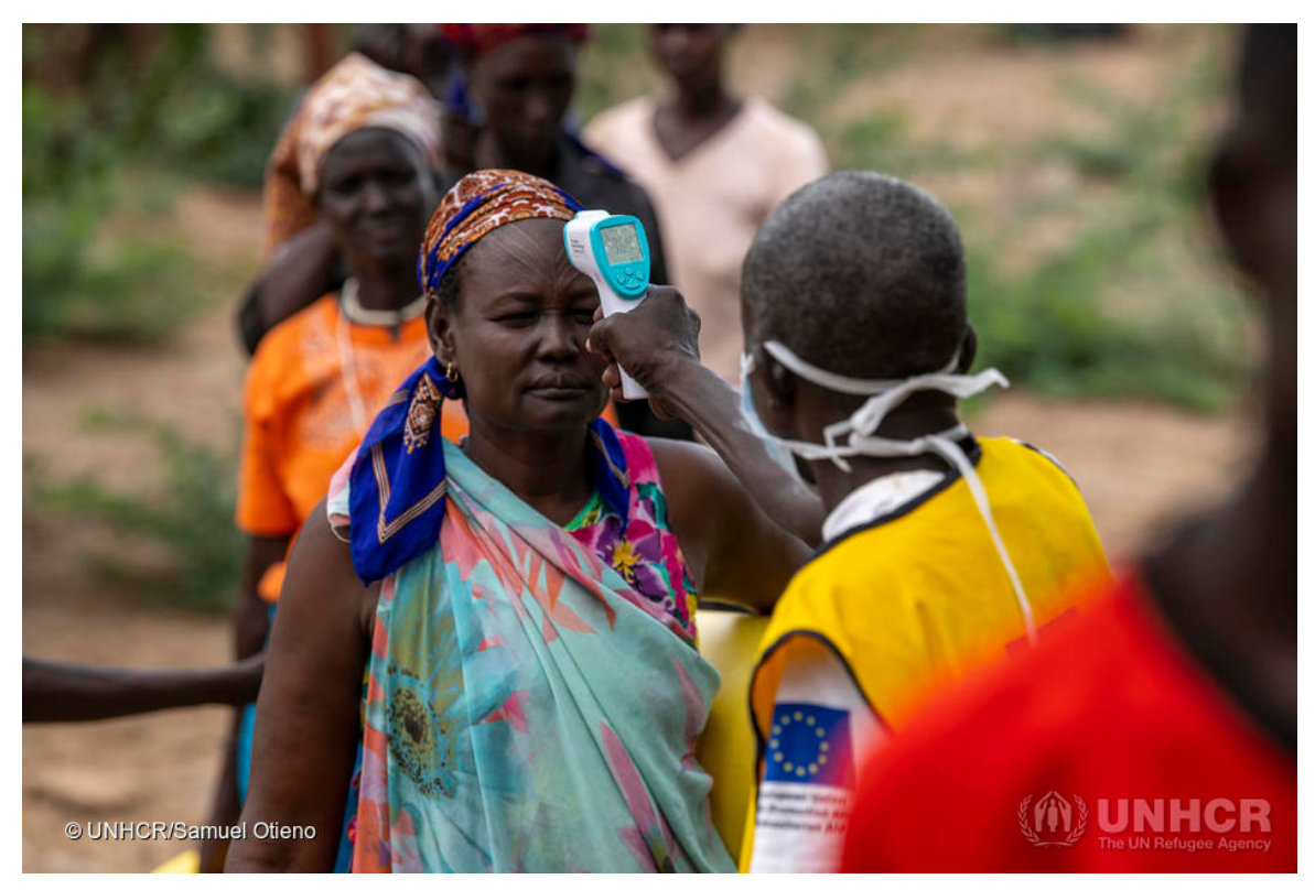
UNHCR and health partner staff have been conducting thermal screening and promoting hygiene measures in the refugee camps in Kenya since the outbreak of the COVID-19 pandemic.