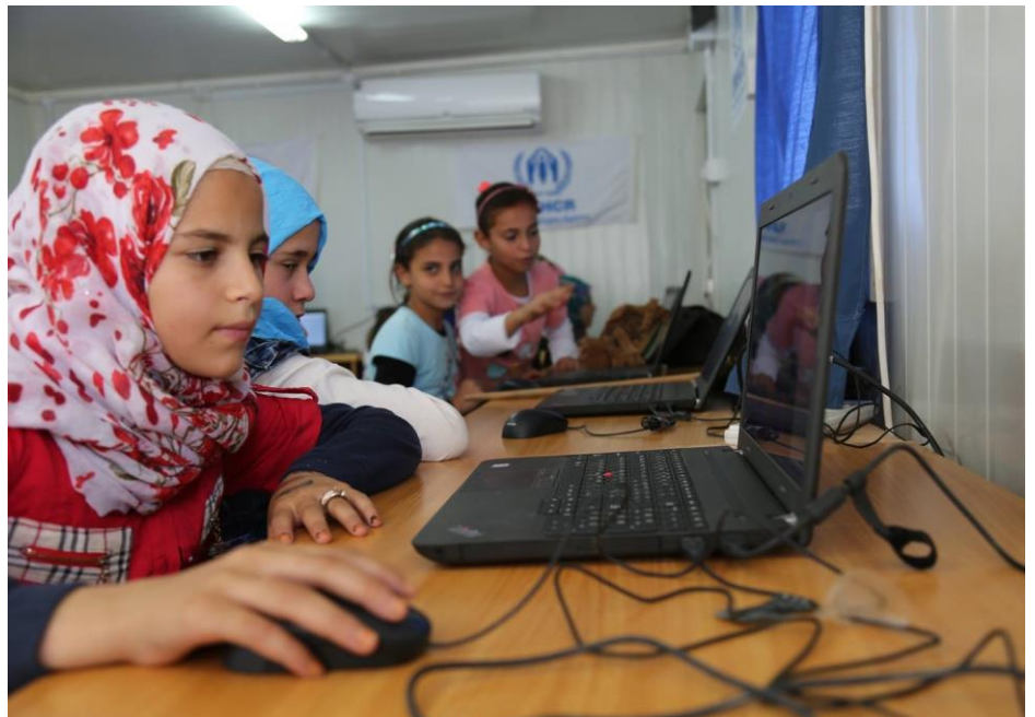
Syrian children benefiting from computer training in one of Azraq refugee camp's four community centres as part of a UNHCR skills training programme. Over half of Azraq's population – 56 per cent – are children.

*This operational update covers activities for the month of January 2017.