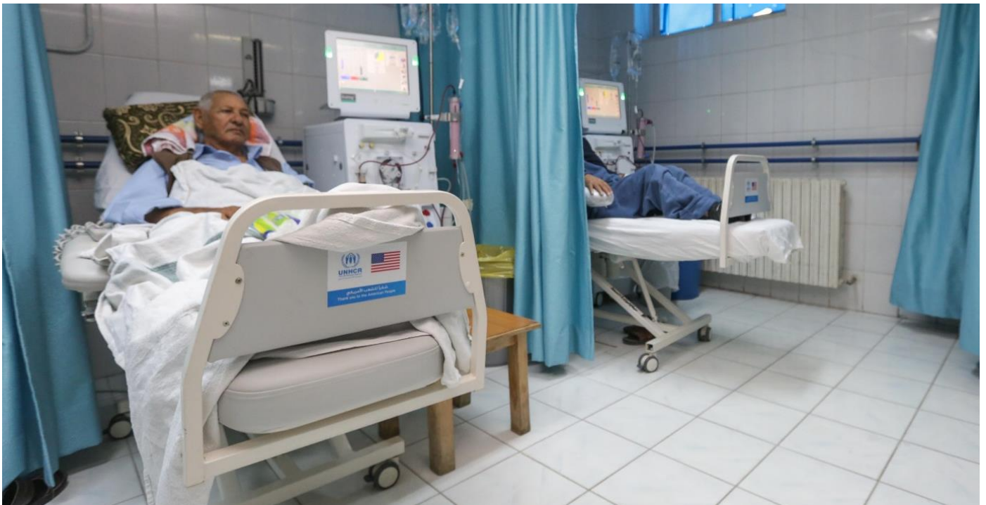
Patients receiving haemodialysis treatment at the UNHCR/U.S.-supported Al-Totajji hospital in Amman.

UNHCR continues to work closely with the GoJ to meet the immediate and short-term health needs of individual refugees while also improving the health services available for the host community in the long term.