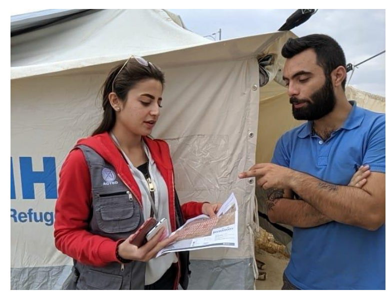
Partners conducting tent to tent protection assessments in Bardarash refugee camp

Since the beginning of the emergency, two camps have been designated to host the new arrivals -- Bardarash Refugee Camp, which previously hosted internally displaced Iragis; and Gawilan Refugee Camp, which already hosts over 7,000 Syrian refugees who fled to Iraq prior to this emergency. As both locations are now reaching full capacity, the authorities in Dohuk Governorate identifying additional site an to accommodate new arrivals. As November 2019, out of the total 14,779 Syrian refugees who have entered the KR-I, over 12,000 individuals are hosted in Bardarash Refugee Camp, and over 2,000 new refugees are in Gawilan Refugee Camp.