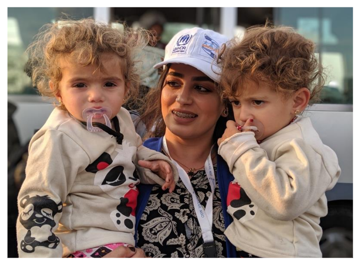
Partners assisting newly arrived refugees at Gawilan refugee camp

Recent military operations in North East Syria forced thousands of people to flee their homes and to seek safety across the border in neighbouring Iraq. As of 9 November 2019, some 14,779 Syrian refugees have crossed into the Kurdistan Region of Iraq. Most new arrivals are originally from Ras al Ain and Ain Al Arab, followed by Qamishli and Darbasiyah.