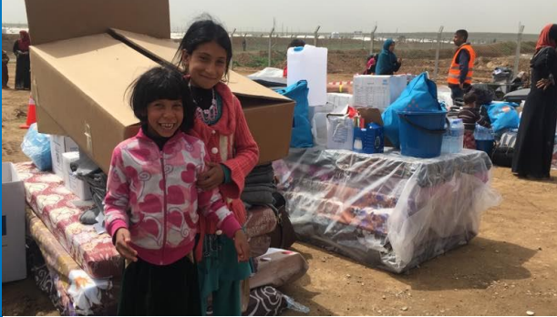
IDP children who recently fled ongoing military operations in west Mosul, and arrived at UNHCR's newly established Hammam al-Alil 2 Camp, south of Mosul.