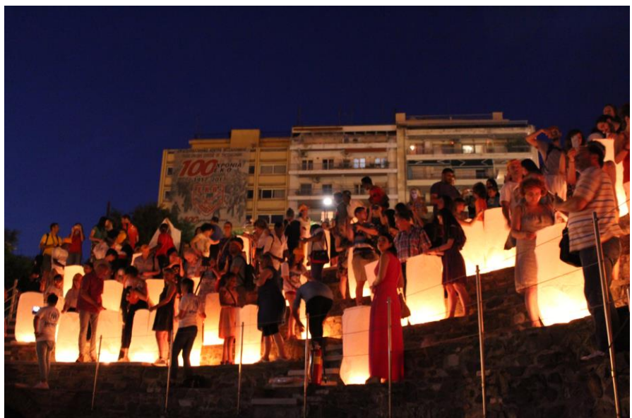
In Thessaloniki, volunteers light lanterns and hold a minute's silence on World Refugee Day, in remembrance of the thousands of refugees who have lost their lives on their journey in search of safety.

4 Field Units in Evros, Ioannina, Leros, Rhodes