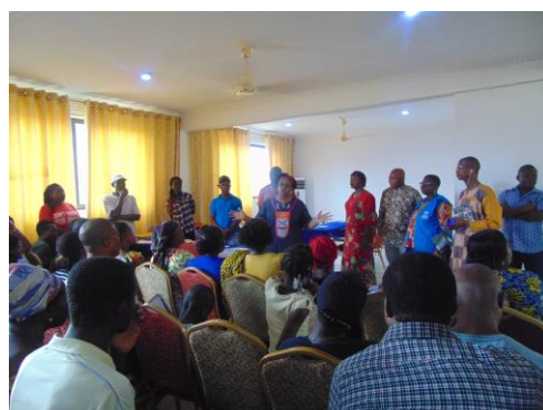
Liberia's Deputy Minister of Legal Affairs, Counsellor Deweh Grah addressing some locally integrating Liberians benefitting from a passport renewal exercise