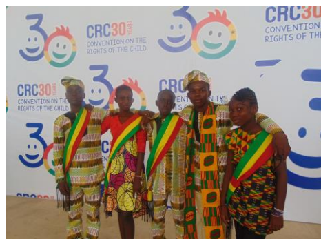
Five refugee children who were child parliamentarians at the first official children's parliament

01 Country Office in Accra 01 Field Office in Takoradi