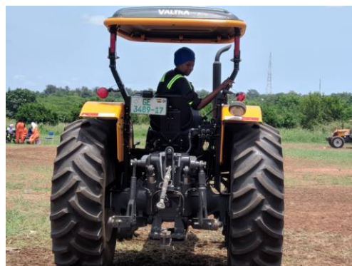
Refugee trainee in the driving seat

01 Country Office in Accra 01 Field Office in Takoradi