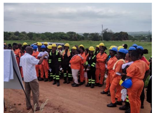
Women trainees with an instructor