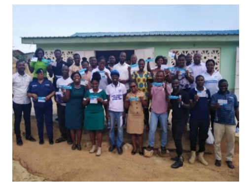
Some participants at the workshop on protection from sexual exploitation and abuse