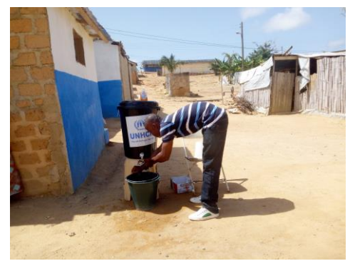
A refugee practising good hand hygiene at one of the hand washing stations in the Egyeikrom Camp

01 Country Office in Accra 01 Field Office in Takoradi