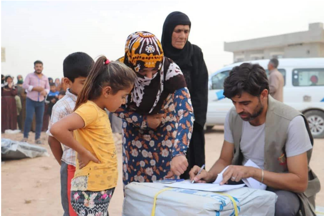
UNHCR partners are meeting with people on the ground in north-east Syria and providing core-relief items to the people in need to ease their suffering.