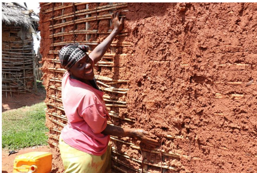
A displaced woman building her shelter in Lubero (North Kivu Province).