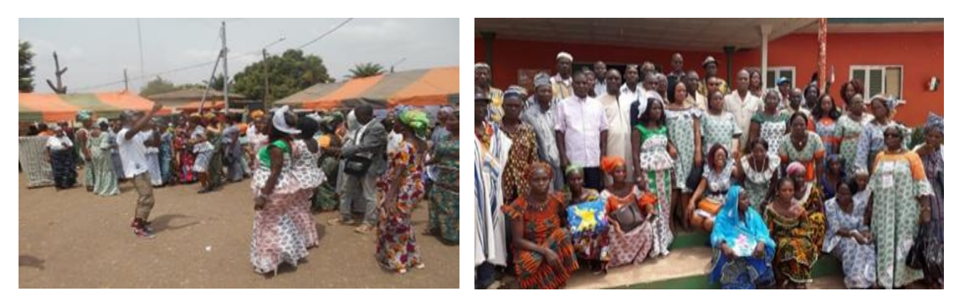
International Women's Day celebration in Danane.

Thanks to the efforts deployed by the Direction for assistance to refugees and stateless persons (DAARA), the National Identification Office and UNHCR, refugees in Cote d'Ivoire can now possess a biometric identity card (National TV coverage). This new identity document, which meets all international requirements and is valid for 5 years, allows refugees to move freely in the country and to perform all acts of civil life such as working, opening bank accounts, sending and receiving money, etc. The enrollment operation targeted more than 1,000 refugees aged 14 years old and above and took place from 25 to 29 of March 2019 in Abidjan, Guiglo, San Pedro and Danané.