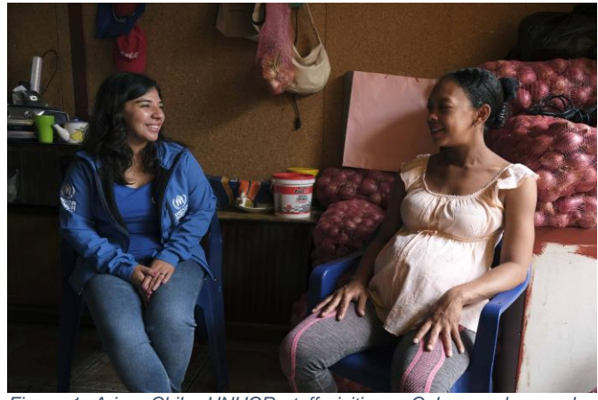
Figure 1. Arica, Chile. UNHCR staff visiting a Cuban asylum-seeker hosted in the country.