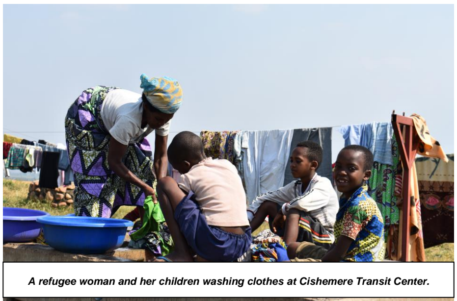
A refugee woman and her children washing clothes at Cishemere Transit Center.