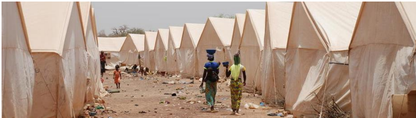
Barsalogo IDP site