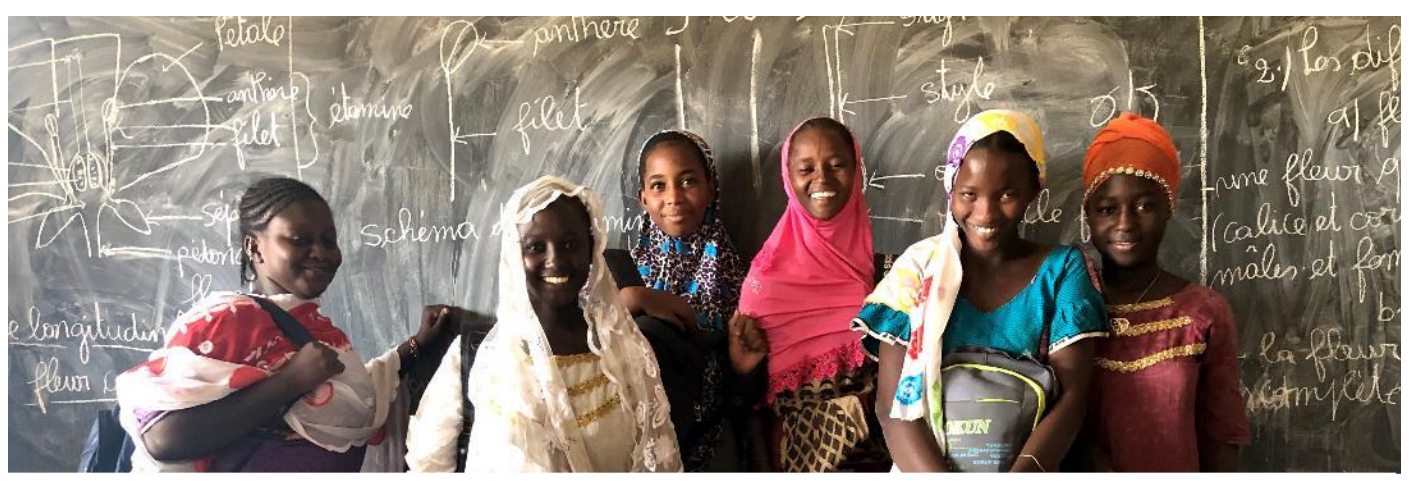
Young refugee girls who are happy to be able to attend the new secondary school in Goudoubo camp in Dori, funded by the European Union Trust Fund