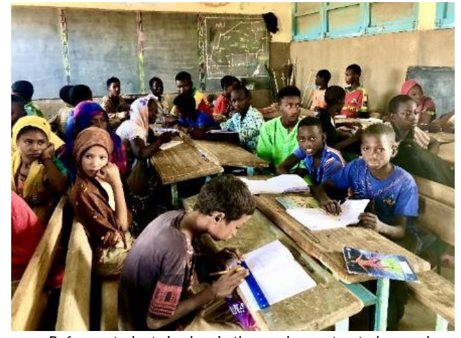
Refugee students in class in the newly constructed secondary school in Goudoubo.