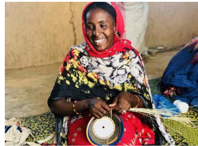
Refugee artisan woman in Goudoubo camp making a lampshade for the UNHCR MADE51 initiative