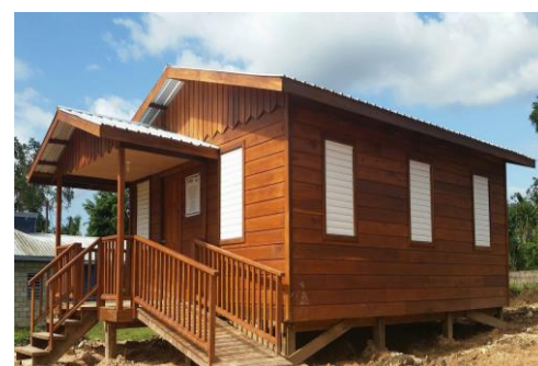
Photo: Health Resource Center in Armenia Community, provided by UNHCR in joint project with the Ministry of Health.