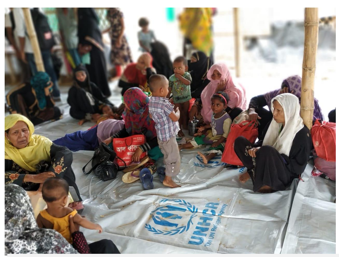
With the help of a multifunctional team of UNHCR staff, refugee families at high risk of landslides, including a group of vulnerable individuals, were successfully relocated from to Camp 4 Extension.

During the reporting period, around 19 refugee families (77 individuals) from high-risk landslide areas in two refugee sites were relocated to safer grounds between. As of 20 August, UNHCR, IOM and partners have relocated a total of 24,786 individuals from at-risk landslide areas in all settlements to various new.